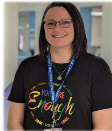
AASBA Spotlight Graduate

For information about employment and occupational related items published by the U.S. Bureau of Labor Statistics visit https://www.bls.gov